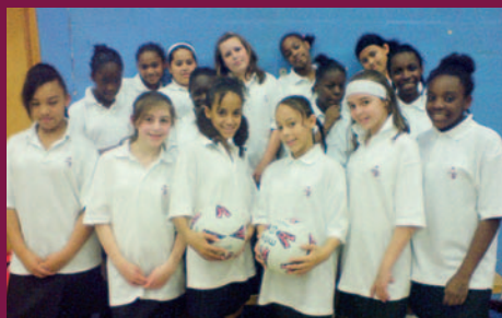
Team: Year 7 Girls – 5th December 2007 12–0 Harris vs Haling Manor (away)